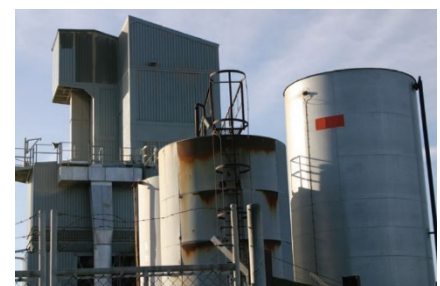
Tanks and Silos