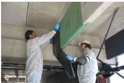
Beams and Slabs